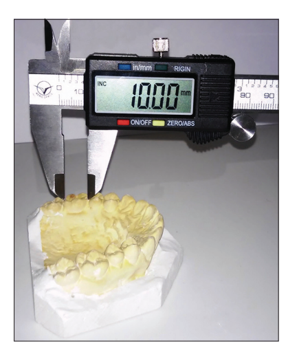
Figure 3: Measurement of mesiodistal width of maxillary first molar of study cast