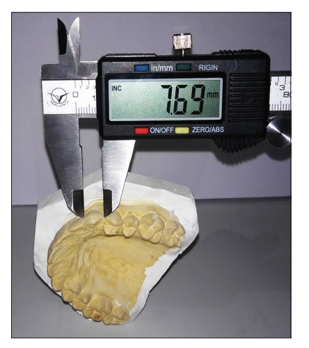
Figure 1: Measurement of mesiodistal dimension of maxillary canine on study cast