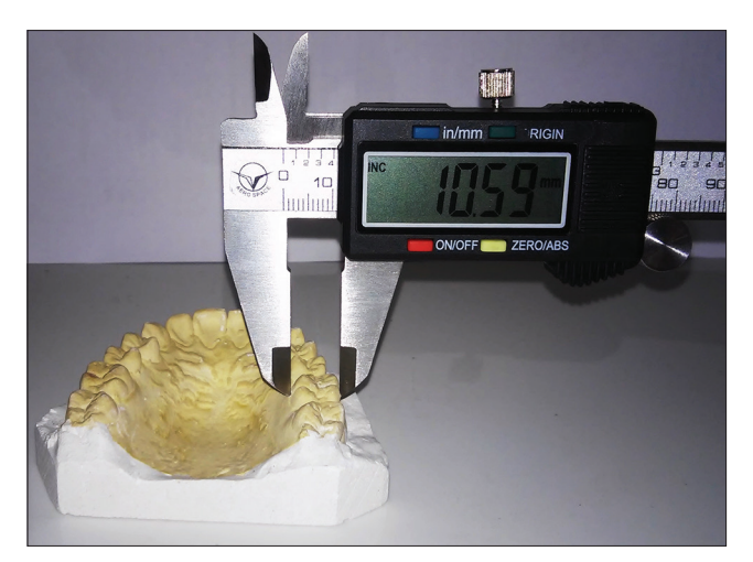
Figure 4: Measurement of buccolingual width of maxillary first molar on study cast

Where a is the canonical discriminant constant, b is the unstandardized coefficient, and P is the parameter. The constants are obtained from the data given in Table 1. After