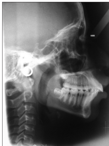
Figure 4: Lateral cephalogram showing CVMI stage 3

Demirjian’s method has good reproducibility [24] and is based on the stages of tooth development, which are unaffected by