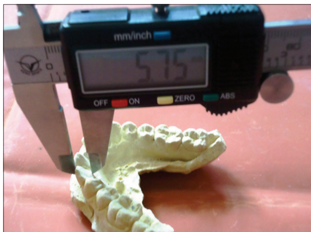
Figure 1: Photograph showing bucco-lingual width of mandibular canine using digital vernier caliper