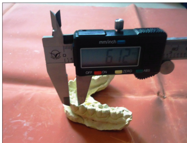
Figure 2: Photograph showing mesio-distal width of mandibular canine using digital vernier caliper