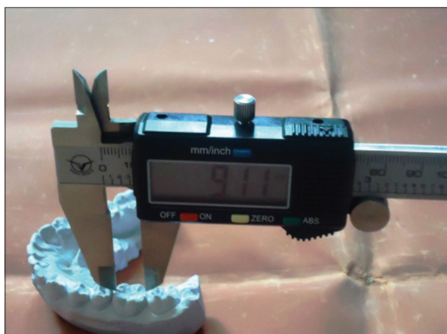
Figure 3: Photograph showing mesiodistal width of mandibular first molar using digital vernier caliper