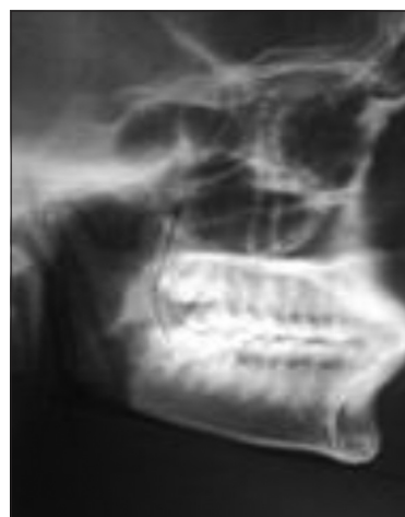
Figure 2: Lateral cephalogram placed on a view box