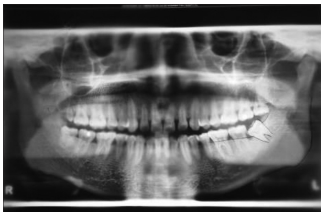
Figure 1: Third molar traced on orthopantomograph placed on an illuminator

Table 7 shows comparison of age assessed on combination of length of condylar height and LMB with chronological age, where there was no statistical significant difference.