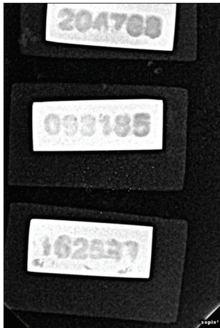
Figure 5: Radiovisiography prior to heat treatment