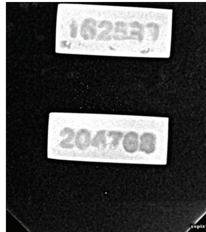
Figure 6: Radiovisiography after heat treatment

at 1,500°C overnight in an electrical furnace, there was no loss of identity code. In Groups II and III also there was no loss of marking after heat treatment. Group IV showed significant loss of identity under oxyacetylene flame with maximum temperature of 1,500°C and pressure of about 200 kg/cm 3 . There was only residue left. The observation of Groups I, II, and III was confirmed with RVG which showed that there was no loss of identity. But, under pressure there was only residue present [Figure 6]. Results are tabulated.