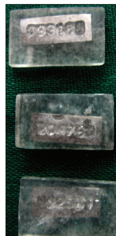
Figure 4: Titanium plates inserted in denture base resin