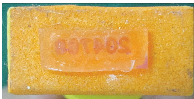
Figure 1: Rubber stamp with identity code